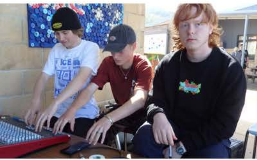
Students enjoyed the lunch time entertainment on the last day of Term 1. The crowd loved it!