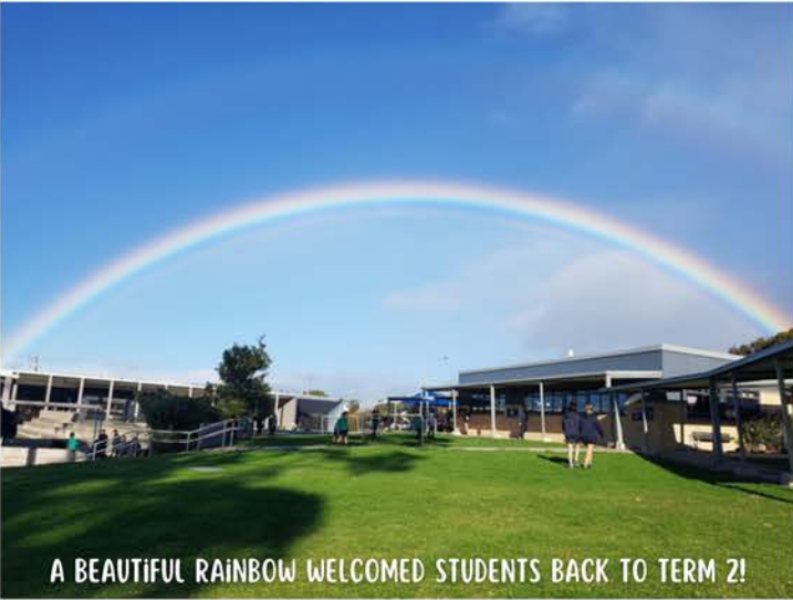
A BEAUTIFUL RAINBOW WELCOMED STUDENTS BACK TO TERM 2!