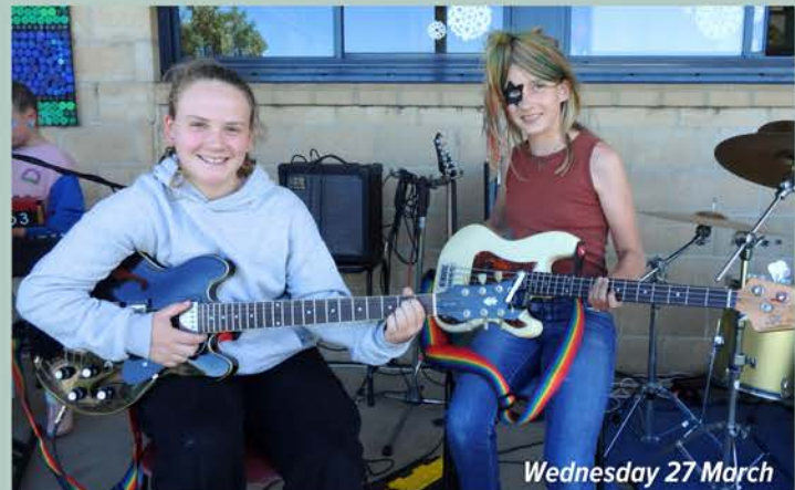
Wednesday 27 March